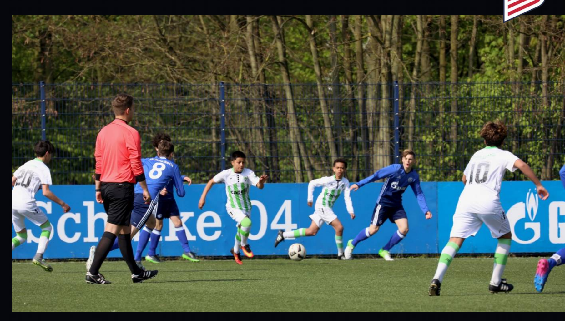
CSA Bergen USSDA 2003 Boys play the Bundesliga's Schalke 04 to a 0-0 draw in April of 2017 on German soil.

the knowledge gained abroad to domestic competition in the USSDA and EDP.